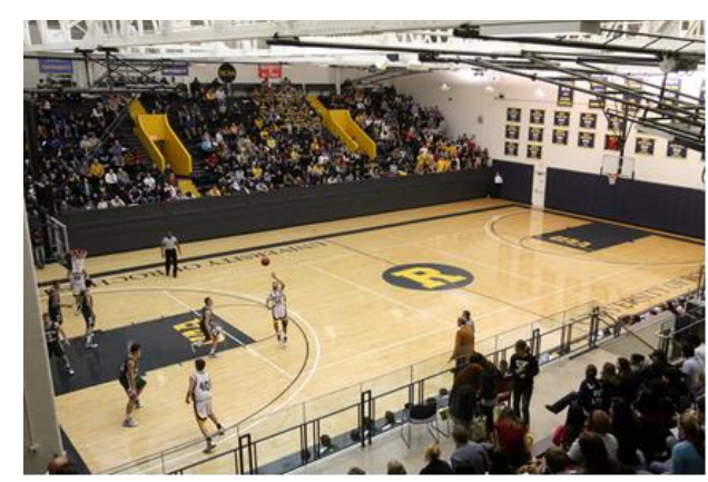
The Louis Alexander Palestra

FEE: $300.00 Commuters/$375.00 Resident (Practice jersey & meals included).